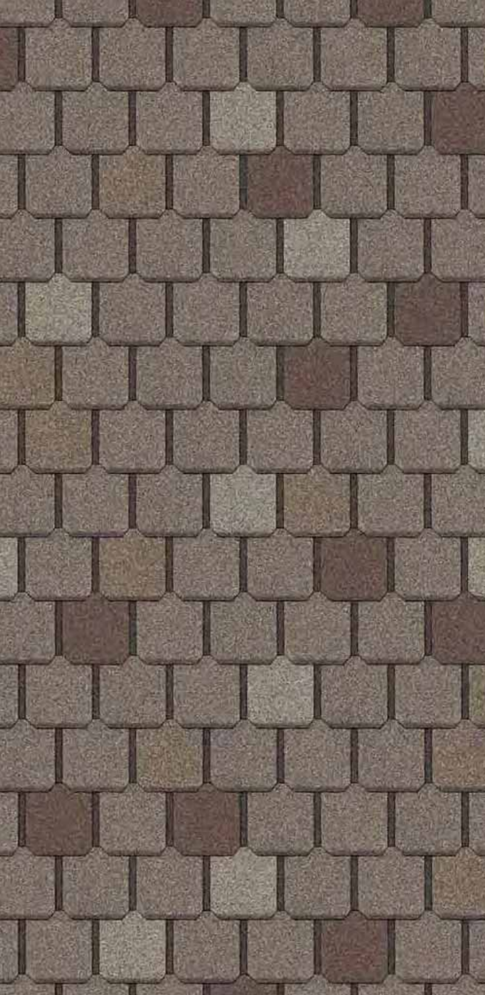
Berkshire® Sherwood Beige†