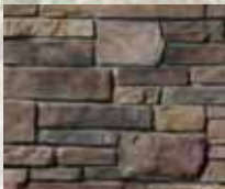
Bucks County Country LedgeStone®

The colors and textures of the brick or stone on your home's exterior can also influence your shingle choice. Balance these strong accents with the color and dimension of your shingles.