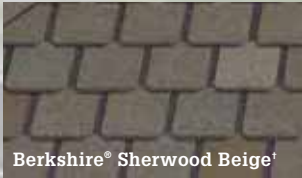
Berkshire® Sherwood Beige'

Choose a shingle with granules that play up the accent colors on your exterior. Also consider how the shingles' shadowing can add dimension to your roof.